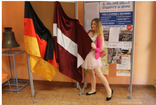
Latvian student in the school, Cento