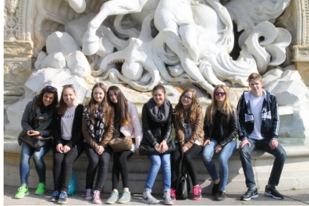
Italian and Latvian students in Bologna